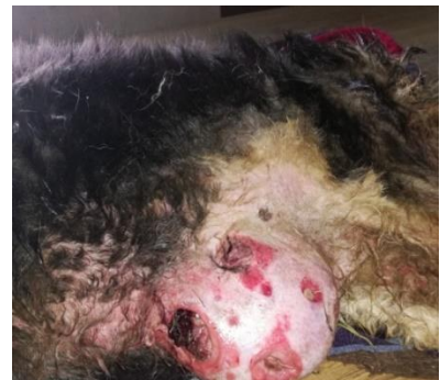
c. Ulcerative mammary tumour with maggots in female dog