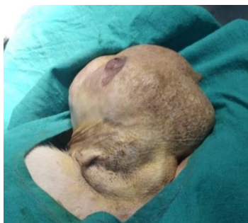
d. Intact mammary tumour in female dog