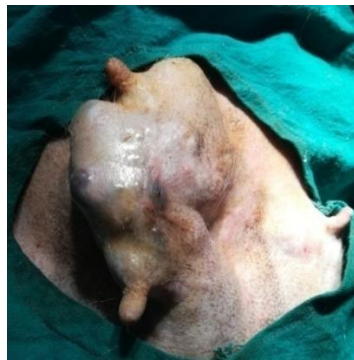
b. Mammary tumour involving both 4 th and 5 th mammary gland