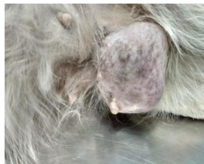
f. Intact mammary tumour