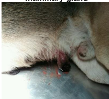
e. Ulcerative mammary tumour with maggots in male dog