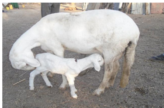
Fig. 3. Typical Begait ewe