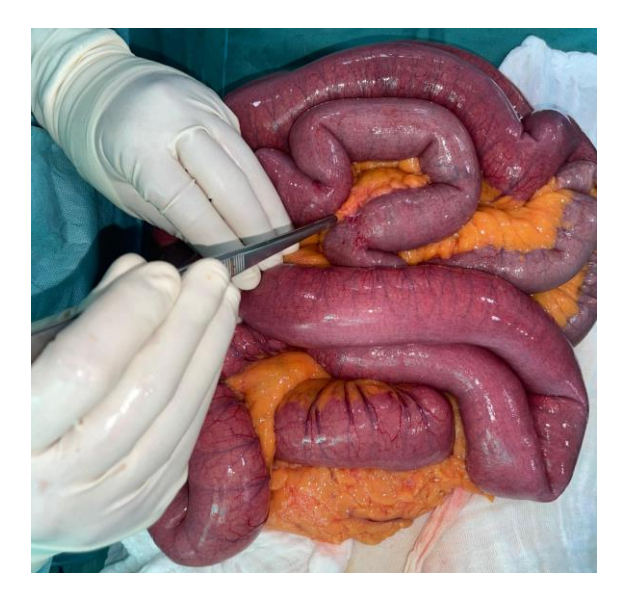
Fig. 3. Distended coves with transitional level