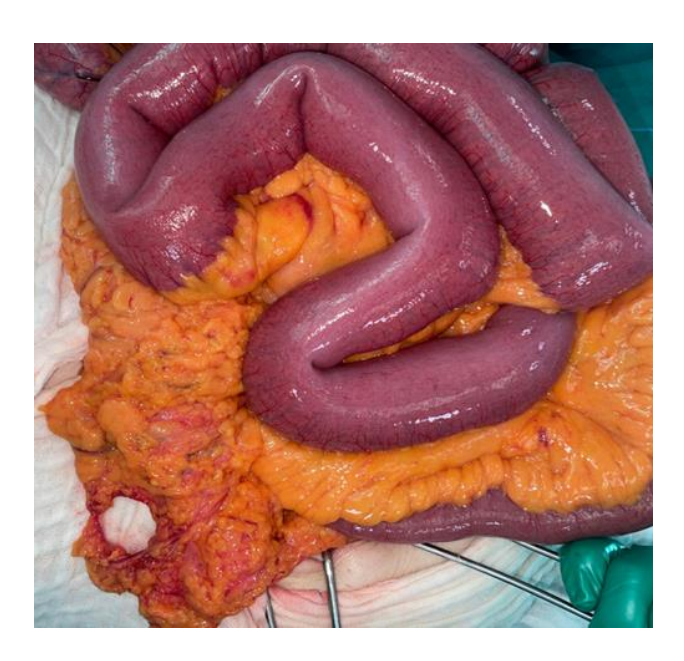
Fig. 4. The trans epiploic hernia orifice