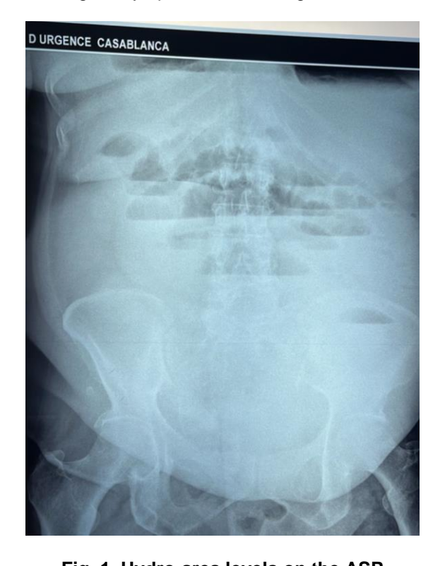
Fig. 1. Hydro-area levels on the ASP

Admitted to our department in an emergency setting for an occlusive syndrome evolving 2 days prior to admission, associated with food vomiting.