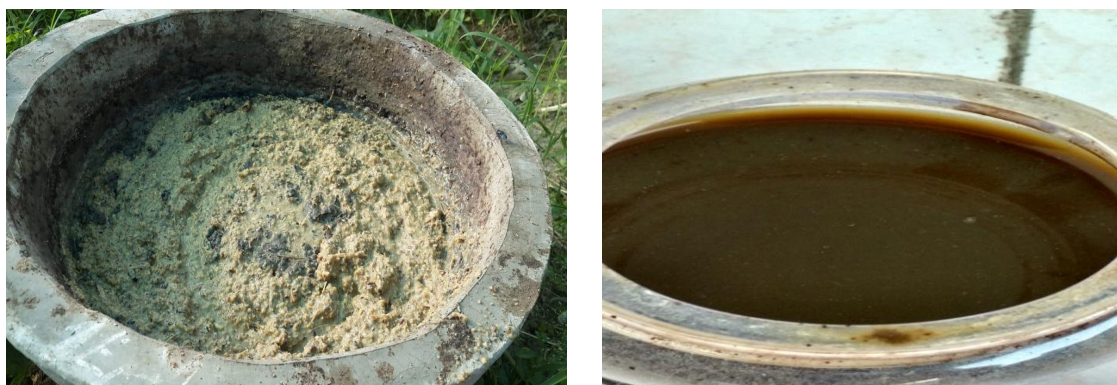
Fig. 1. Kunapajala- Fermentation State and liquid extract after filtering